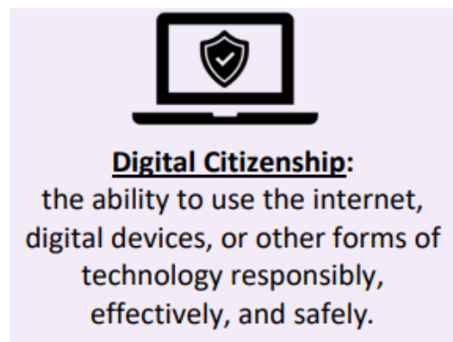
Figure 3: What is Digital Citizenship?

Incoming skills and education may also present a barrier to entry for some. This is especially true for sub-populations of TANF caseloads such as persons with a criminal record, children in the foster