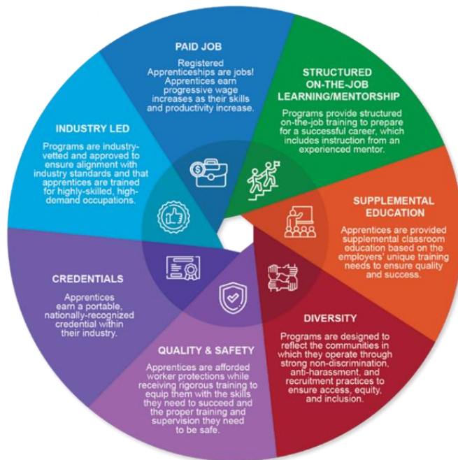
Figure 1: The Seven Elements of a Registered Apprenticeship Program

Registered Apprenticeships (RAPs) and pre-apprenticeships (Pre-RAPs) are an excellent alternative pathway to employment. They pair classroom instruction with on-the-job training so apprentices can earn money while they learn (See Figure 1). The completion of a RAP yields a highly employable credential and can land someone an excellent job in a stable field; 91% of apprentices are employed full time upon completion. 3 For those who do not meet entry requirements for a RAP such as those without GEDs or those under the age of 18, Pre-RAPs can put a young person on the path to